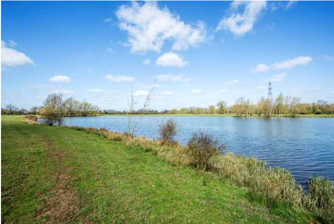
Willington Lake: open western arm