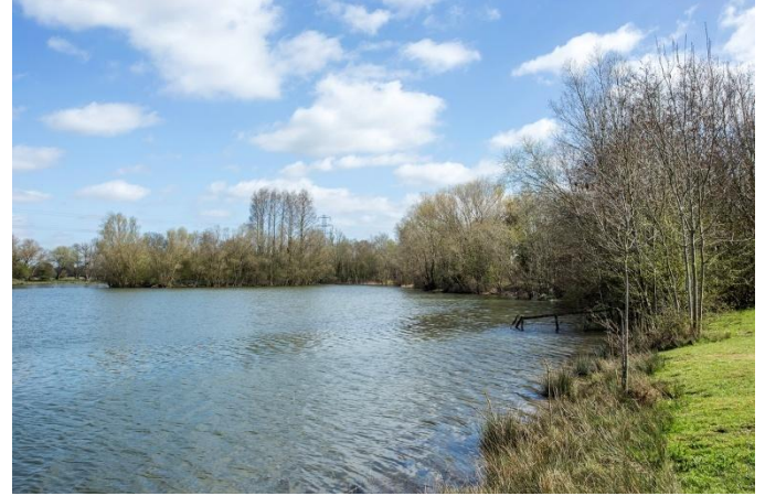
island (above) tree lined track (to right)