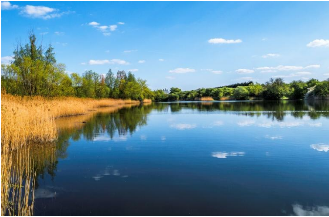
The Airman in Spring