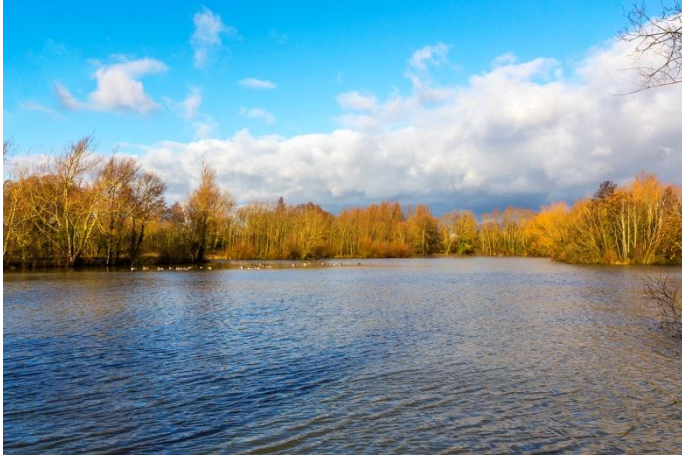
Broom Lake in January