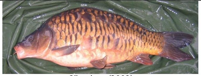
8lb mirror (2009)

November 2009 AJS Fisheries C3 'scaley' carp 19 mirrors Average: 8lb (range: 6-10lb)