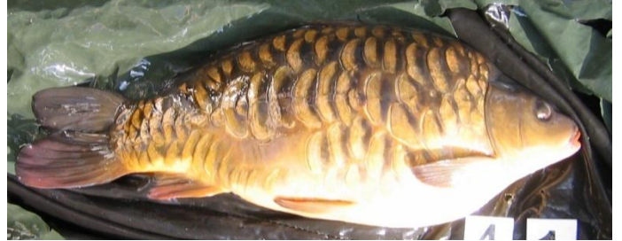
6lb 12oz mirror (2011)

October 2011 AJS Fisheries C3 'scaley' carp 55 mirrors plus one common Average: 5.5lb (range: 4-7lb)