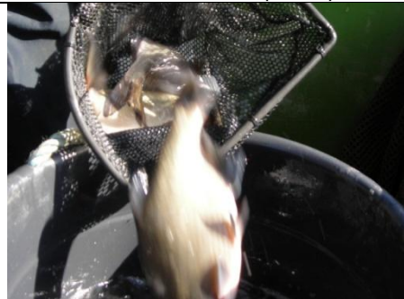
6oz-1lb bream (2014)

March 2014 Mainstream Fisheries 200 bream Size: 6oz-1lb