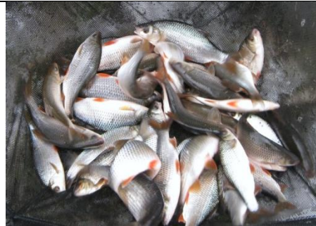
8-10 inch roach (2013)

March 2013 Southern Fisheries Services 600 roach Size: 8-10 inches