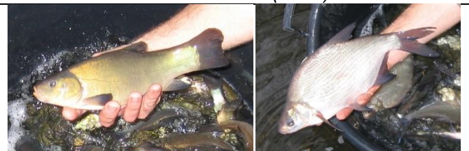
6oz-1lb tench and bream (2014)

December 2014 Meadow View Fisheries 500 tench & bream Size: 6oz-1lb